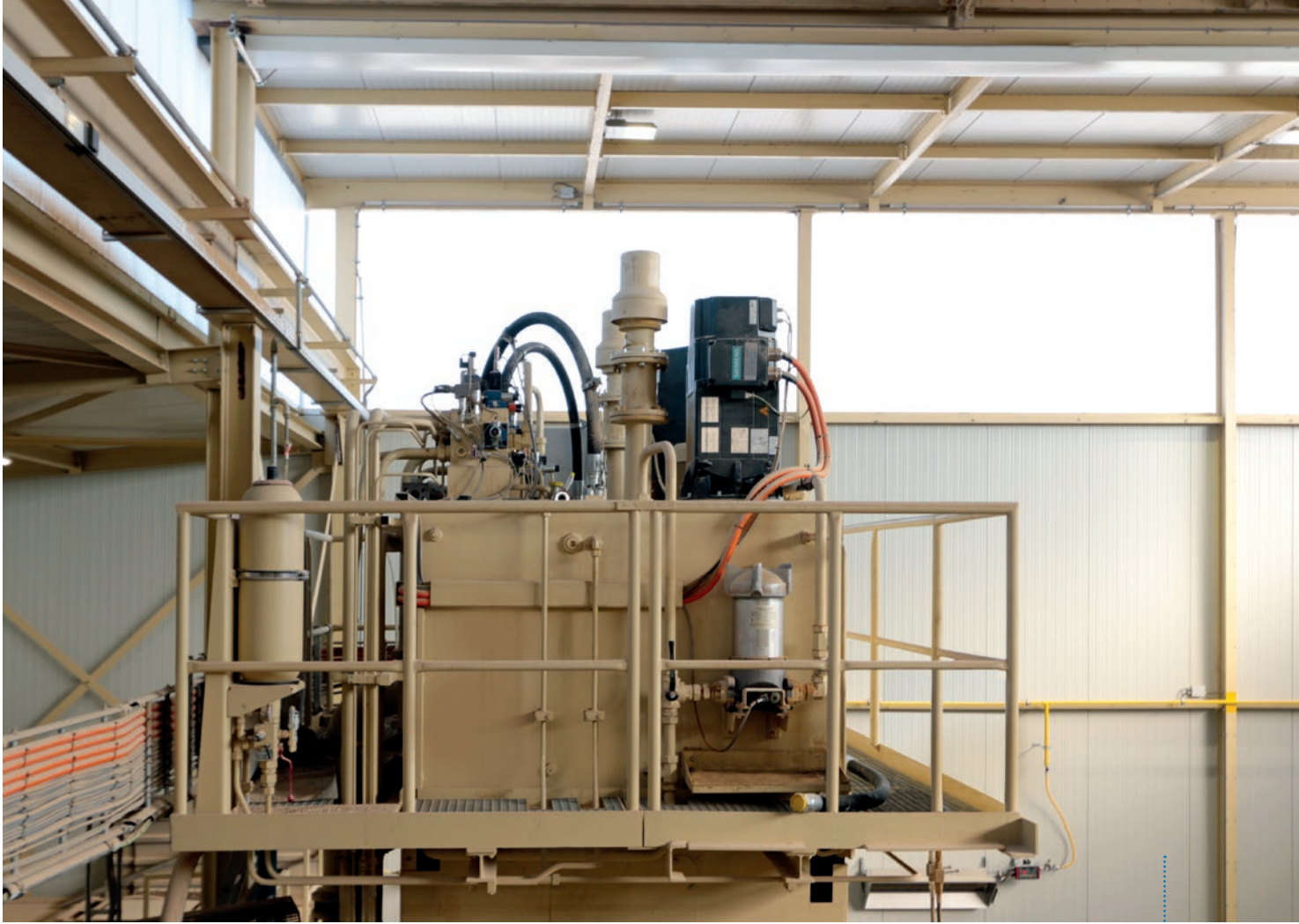
Mechanical drive system for servo hydraulics.

the manufacture of "white products" made of sand-lime brick and autoclaved aerated concrete (AAC). The range of products for the sand-lime brick industry includes machines and plant for the entire production process, ranging from material storage and treatment through pressing, sawing, autoclaving and packing to turnkey plants, including all handling and transport equipment.